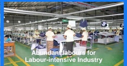
Abundant labours for Labour-intensive Industry