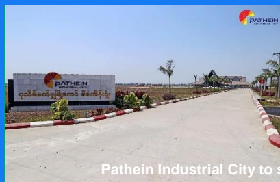
Patheingyi Industrial City to serve the potential investors