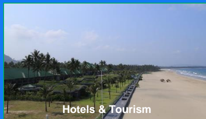
Hotels & Tourism