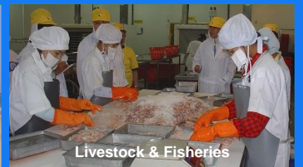
Livestock & Fisheries